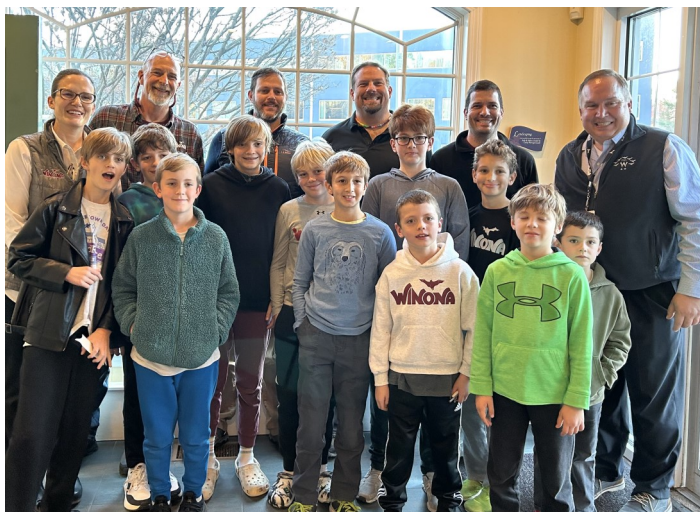
November 2023, Metro Boston

Winona, along with our sister camp Wyonegonic, enjoyed seeing campers, staff and alumni at our fall regional gatherings. These gatherings are a good opportunity to visit with friends, or meet the Winona directors for the first time (also, there's usually some very yummy food!). Thanks to all the campers and their families who attended.