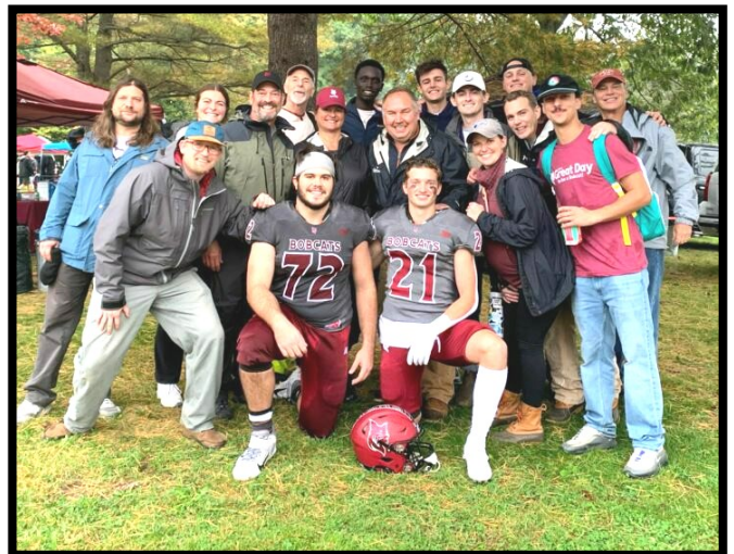
Go Bobcats! Lots of fun to watch current and former Winona staff play on the football team for Bates College. Many Winona Friends showed up to cheer!