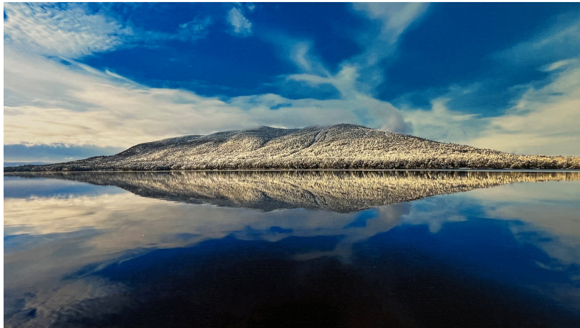
Winter photo by Uncle Clay Miles

It's hard to believe 2024 is here and another summer on the shores of Moose Pond is just around the corner! Winona staff are already planning for our upcoming season. We are looking forward to seeing you "on the shores in '24"!