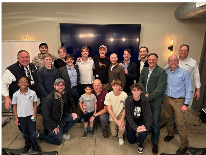
November 2023, New York City