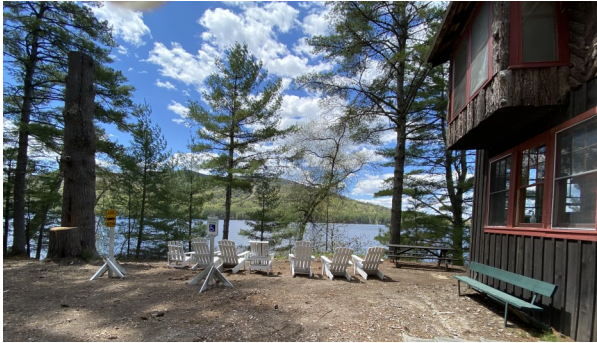
Welcoming white chairs are ready on the shores of Moose Pond.

Work-Week Crew are here, getting camp ready as we gear up for our 114th Season.