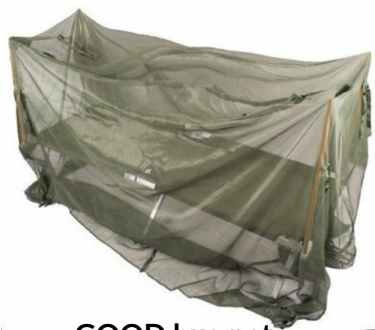
GOOD bug net (provided by Winona)

Did you know Winona provides bug nets to any camper who wants one? No need to buy a bug net. The ones Winona supplies are easy to set-up AND easy to move out of the way for the times you don't need it.