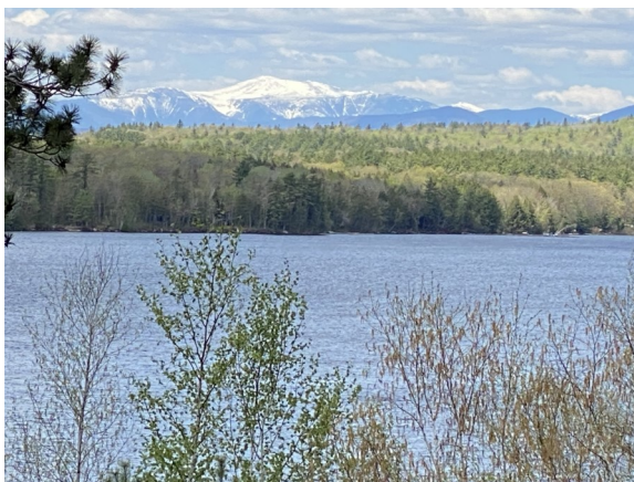
Beautiful springtime view of Mount Washington (NH) from the Winona Junior Wiggy.

We are pleased to announce Winona's new SQUADRONS: