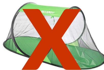
This is a space and safety issue.