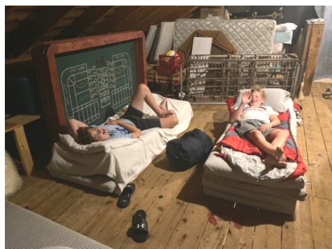
Seniors riding out the storm in the trunkroom.