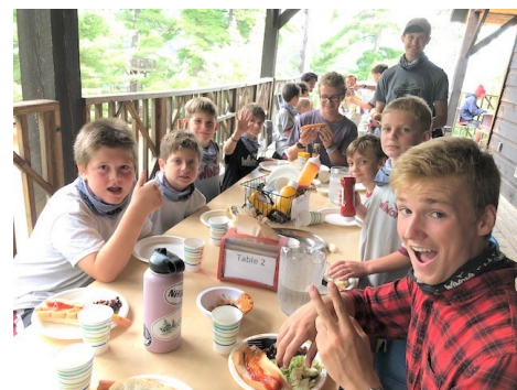
Junior meals on the Wiggy porch.