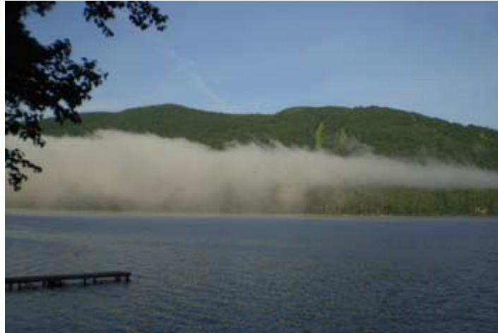
The shores of Moose pond with Pleasant Mountain beyond the morning mist.